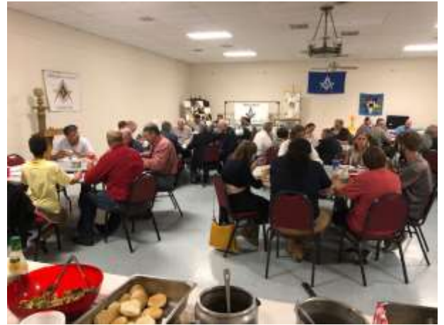
ENJOYING A GREAT MEAL