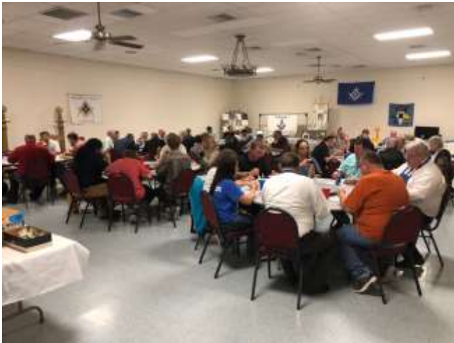
DIFFERENT ANGLE OF SUPPER