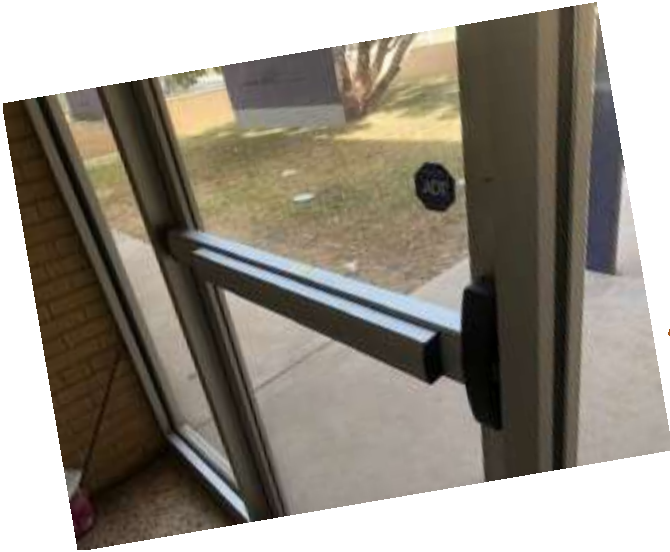
CRASH BARS INSTALLED ON FRONT DOORS