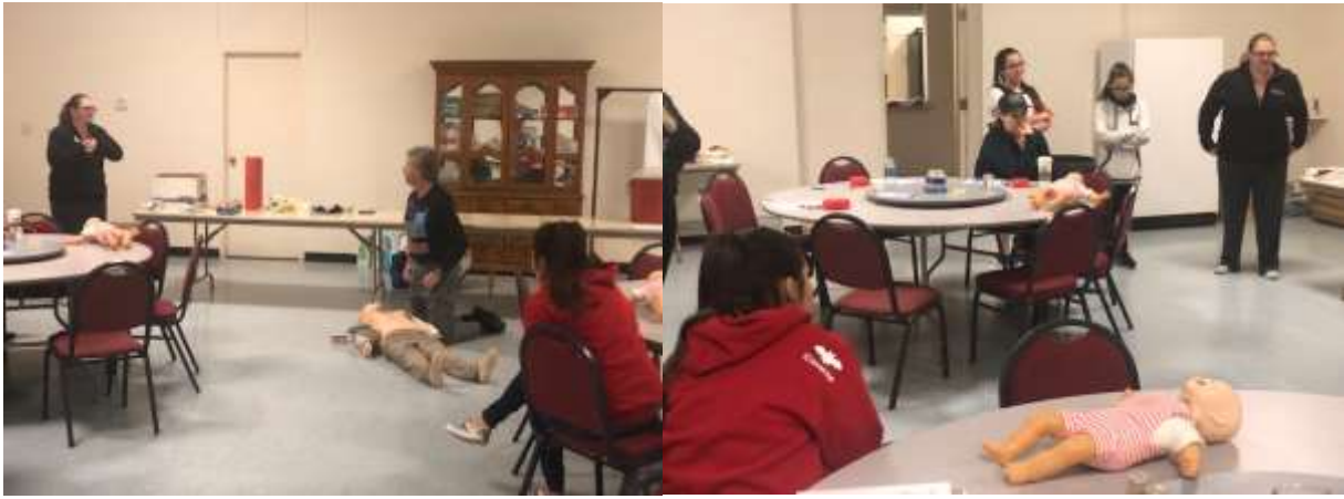
CPR Training at the Lodge for the Girl Scouts