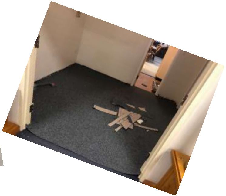
PREP ROOM PAINTED & NEW CARPET