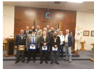
The 2018 Officers

Help us make your lodge a community function! We need you to participate... we want to earn your annual dues!